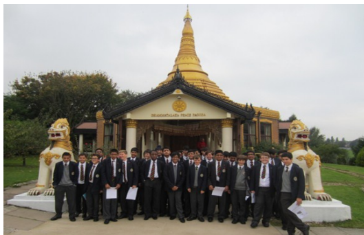
Year 9 students towered by the Peace Pagoda

Oliver Mills accounts: The Year 9 trip to the Peace Pagoda spanned over two days, where a group was taken each day to the Pagoda in Birmingham for a tour followed by a talk. The tour took us around the building and we were shown many of the symbolic elements of the garden such as the prayer wheels and fish ponds. We then enjoyed a talk by Mr Black who elaborated on many of the Buddhist traditions and revealed an insight into the religion. We also had a go at meditation and were told about some background history on the Pagoda, its initial set up and how it's being run. Overall, it was an interesting experience, giving us an insight into another way of looking at how we live.