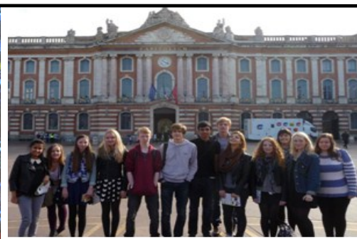
Members of the 2013 French Exchange