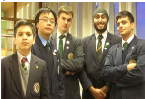
The Chess Team

Follow us on Twitter @qmgs1554 and look out for the various departmental accounts