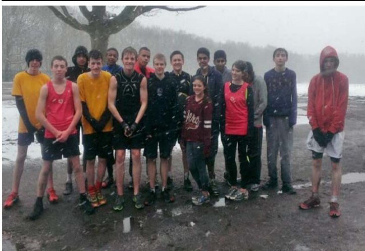
Members of the QMGS Cross Country team